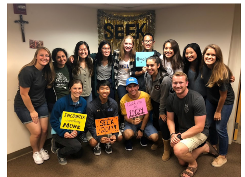
FOCUS Seek Party