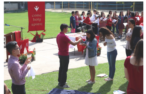
Mass on the Grass