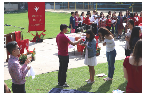
Mass on the Grass