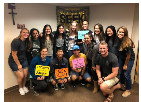
FOCUS Seek Party