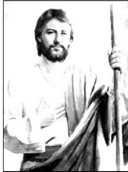
St James, Pray for us! Protomartyr of the Apostles, Pray for us!