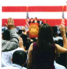
Ciudadanía le da una voz y un voto, libertad de viajar donde sea, cuando sea y el poder para traer a su familia junta y mantenerlos juntos en los Estado Unidos.

Citas son recomendadas, pero no requeridas. ¡Sin cita son bienvenidos! | Para hacer una cita, por favor llame al: (213) 251-3503 o (818) 342-4686