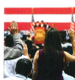
Citizenship gives you a voice and a vote, freedom to travel wherever, whenever and the power to bring your family together and keep them together in the U.S.

Appointment recommended, walk-ins are welcome! |