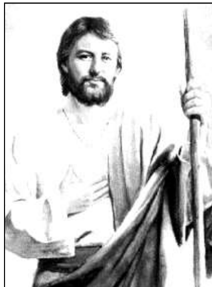
St. James, Pray for us!

Holy Mass @ 8:00am, Adoration 8:30– 11am followed by Chaplet of Divine Mercy and Benediction