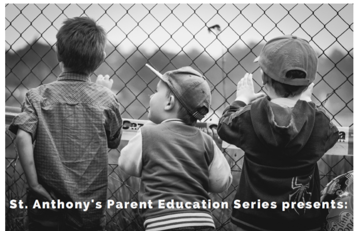
St. Anthony's Parent Education Series presents: