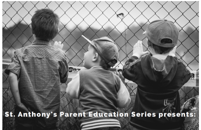
St. Anthony's Parent Education Series presents: